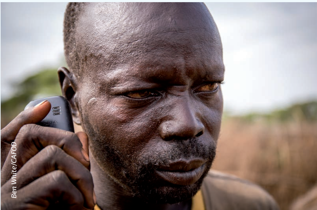
Use of technology in rural areas in Uganda