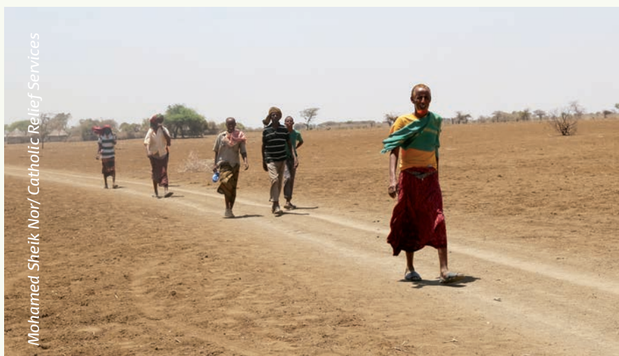
In the East Africa Crisis appeal in 2017, families affected by the drought in Somalia made their way to the camps of Baidoa

The majority of people living in poverty are women. The preferential option for the poor therefore means that a special focus must be given to tackling inequality and discrimination faced by women –addressing issues of land rights, access to education, participation of women in dialogue, leadership, employment and access to justice. This is a challenge for all organisations working in development, including the Church.