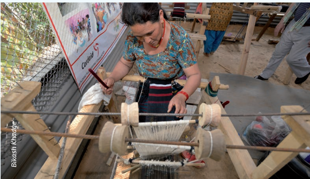
Women displaced by the Nepal Earthquake in 2015 learn new skills such as rug weaving from CAFOD partner CORDAID and their local partners