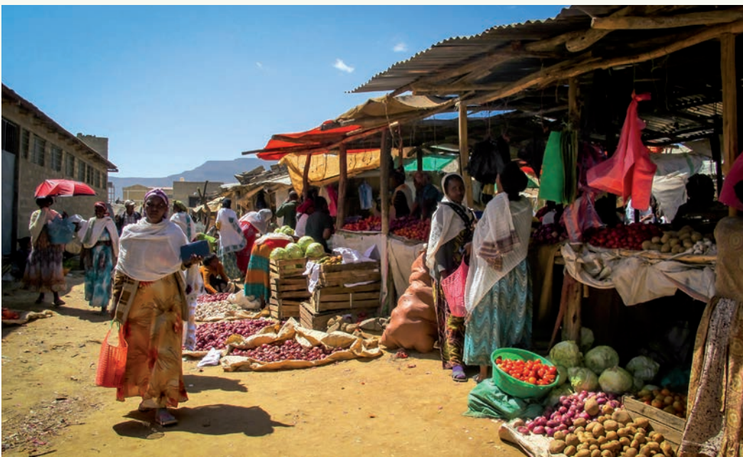
Local markets are essential to many people's livelihoods

A goal of business and economic activity should be steady employment for everyone (CV 32) and a dignified life through work (LS 128). To provide employment we need a diverse and creative economy (LS 129) that includes a focus on supporting small producers and “small-scale food production systems which feed the greater part of the world’s peoples” (LS 129).