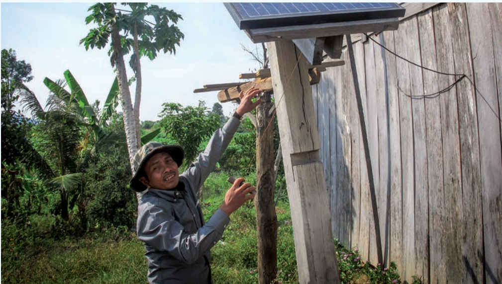
Renewal energy brought to rural areas in Cambodia